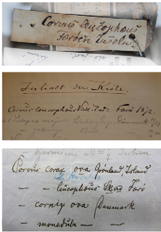
Figure 1. Benzon's handwriting and spelling compared: